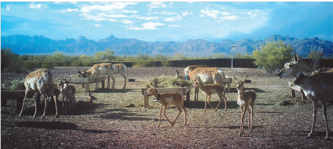
Adults and fawns at the feeders in Kofa pen.

Wild Pronghorn Cabeza/ORPI/BMGR herd : On the last telemetry flight, the pronghorn were spread out over most of the range. Nineteen fawns were seen with 29 females. Most of the range is still green, especially the Tule Desert, Growler Valley and parts of South Tac.