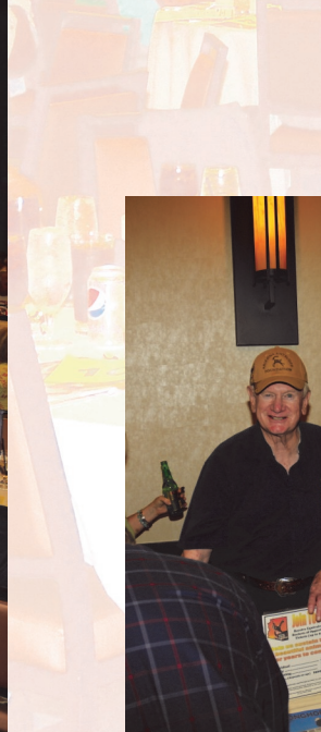
AZ ANTELOPE FOUNDATION & AZ D PHOTOS BY RICH