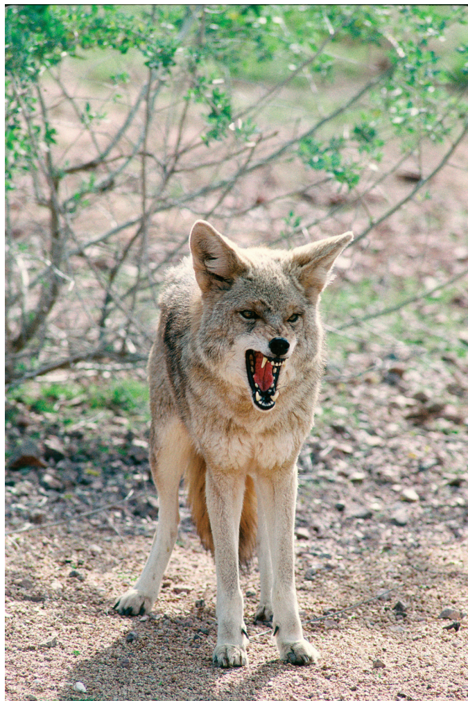
Managing the effects of coyotes and other predators on prey such as pronghorn is a challenge.

The science of wildlife management continues to evolve, building on knowledge gained through research and management. When the Arizona Game and Fish Department takes an action, such as to pursue a translocation to extend the range of a species, it is a result of a management decision. Similarly, taking no action in a particular instance, such as deferring that same translo-