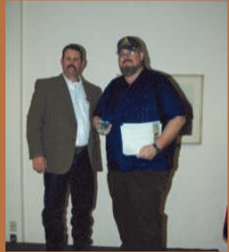
Heritage Metalworks, Inc. AAF Vendor of the Year