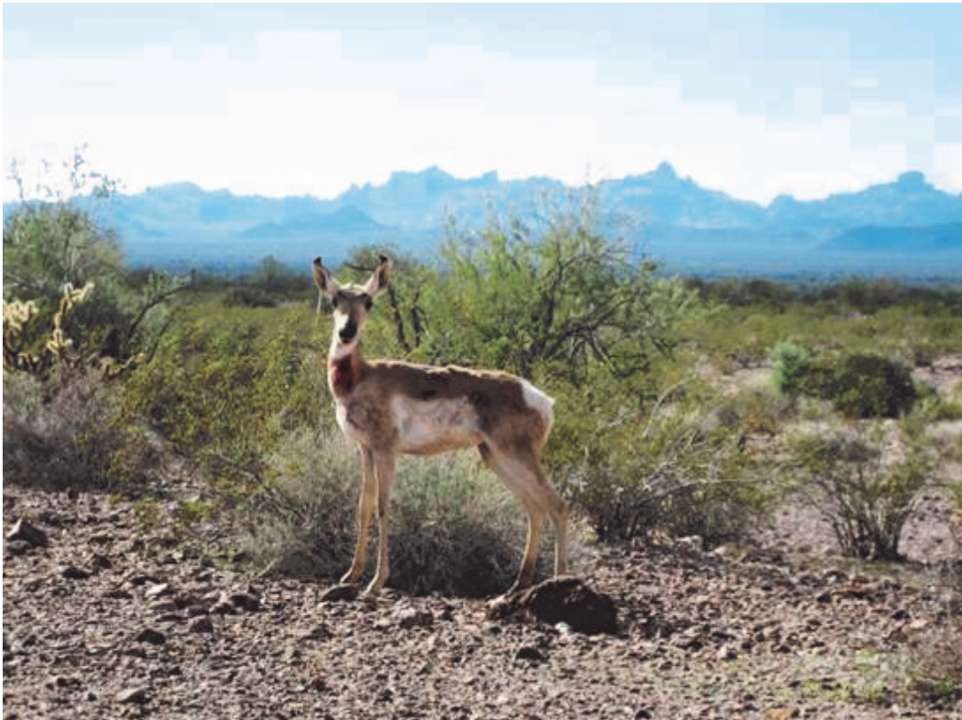
One of the first pronghorn on Kofa refuge.