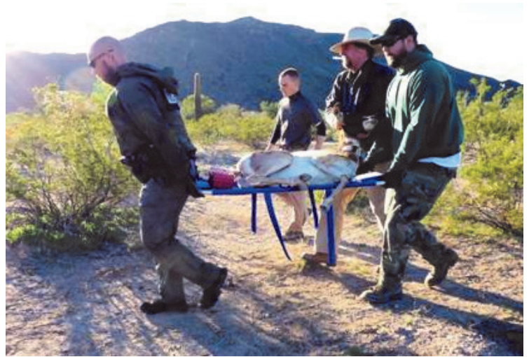
Transporting into the Orpi holding pen