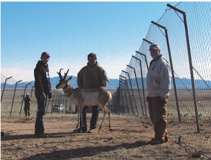
Chino Valley High student volunteers place antelope decoy