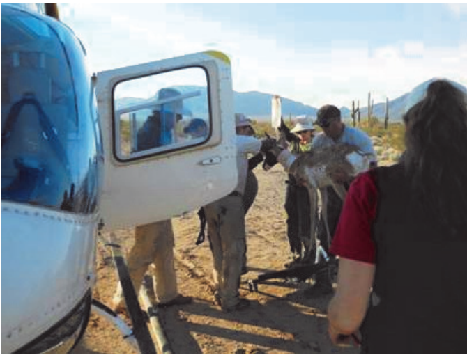
Moving pronghorn to Orpi holding pen by helicopter.