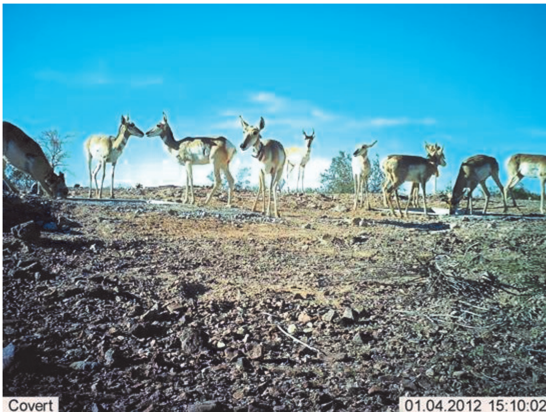
One of the first pronghorn on Kofa refuge.

Wild Pronghorn: Most of pronghorn range is very green except the northern San Cristobal and northern Mohawk Valleys. On December 18-19, we captured 9 wild pronghorn (8 females and 1 male) and put either GPS or VHF collars on them to increase our monitoring ability of the wild herd.